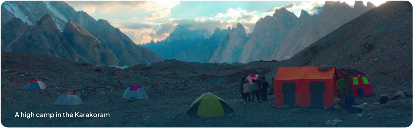
A high camp in the Karakoram