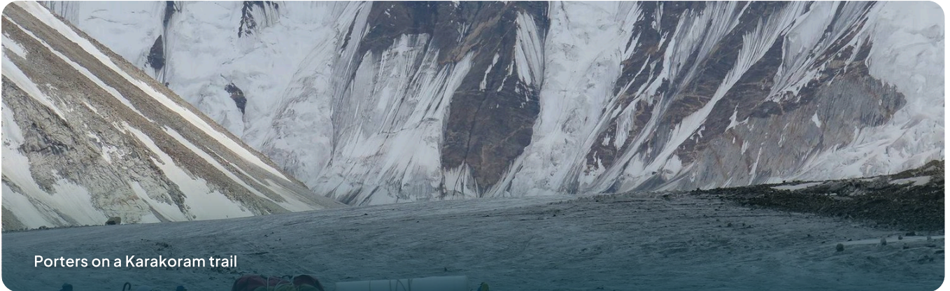
Porters on a Karakoram trail