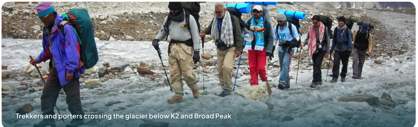
Trekkers and porters crossing the glacier below K2 and Broad Peak

A three-course supper, then the plan and weather for tomorrow.