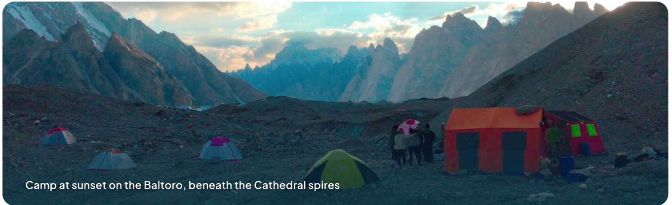
Camp at sunset on the Baltoro, beneath the Cathedral spires

Twin-share dome tents with mattresses, plus heated mess, kitchen and toilet tents. Pitched and struck by our crew each day.