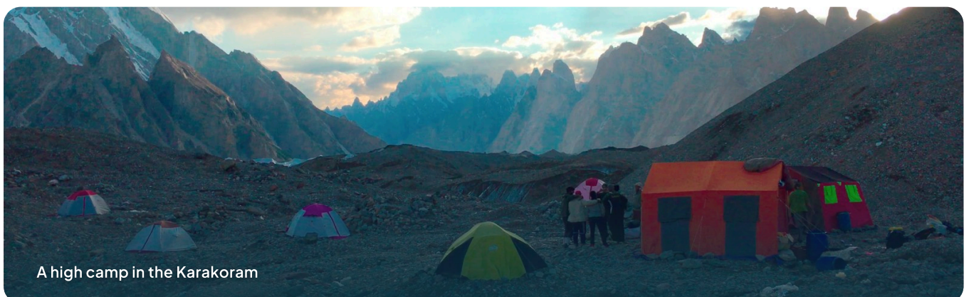
A high camp in the Karakoram