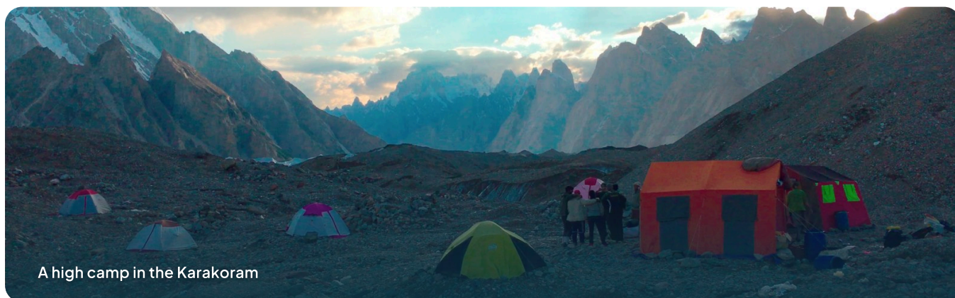
A high camp in the Karakoram